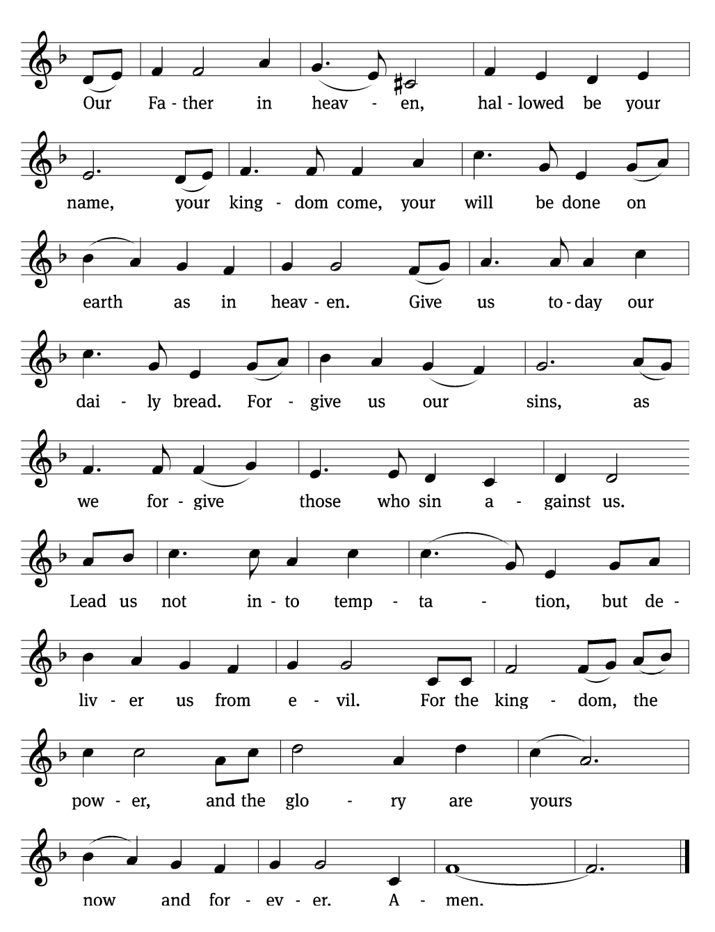
Tune: Dale A. Witte