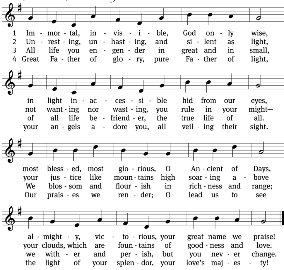
Hymn 614 Immortal, Invisible, God Only Wise