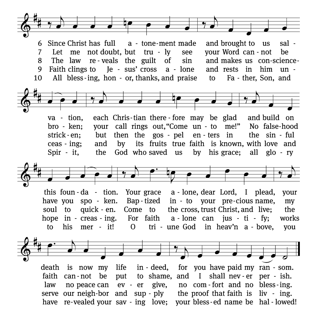
Text: tr. The Lutheran Hymnal, 1941, alt.; Paul Speratus, 1484–1551, abr., alt. Tune: Etlich Cristlich lider, Wittenberg, 1524 Text and tune: Public domain

558 Salvation unto Us Has Come sts. 6–10