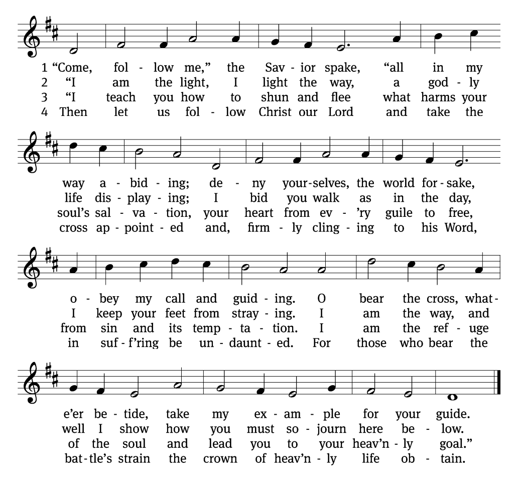
Text: tr. Charles W. Schaeffer, 1813–1896, alt.; (sts. 1–2, 4): Johann Scheffler, 1624–1677, abr.; (st. 3): Geistliche Lieder und Lohgesänge, 1695 Tune: Bartholomäus Gesius, c. 1555–1613, adapt.