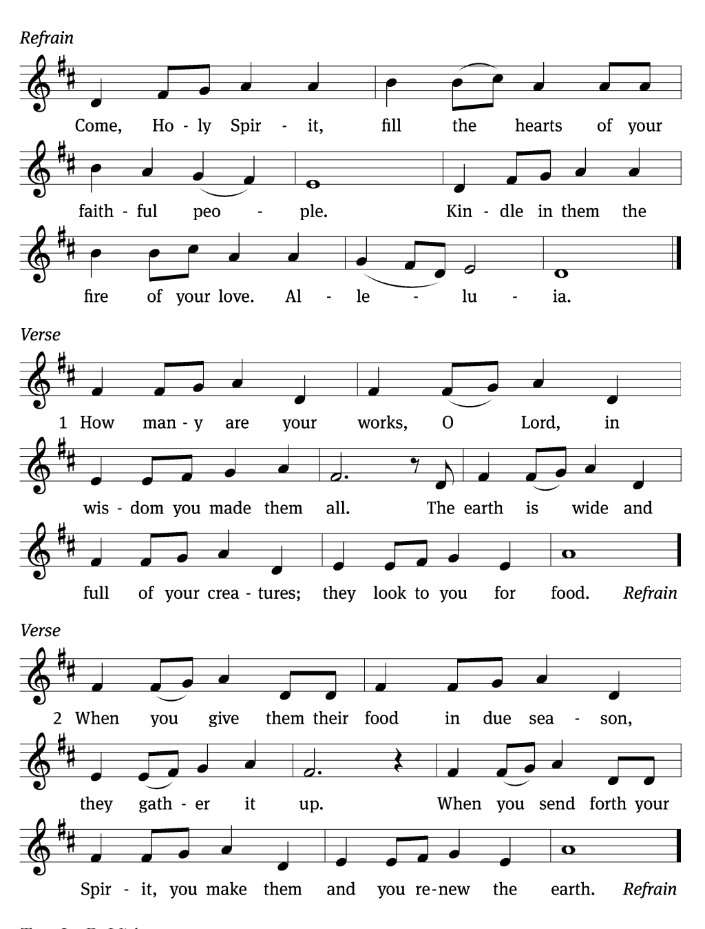
Tune: Jon D. Vieker

Tune: © 1992 Concordia Publishing House. Used by permission: OneLicense no. 734541